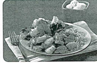
Pineapple, carrots, and tomatoes add tang to this Sweet and Sour Pork, served with a colorful salad. Finish with nonfat frozen yogurt.