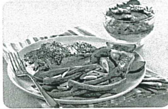
Flavorful herbed green beans and roasted potatoes round out this Smoky Mustard-Maple Salmon. For dessert, enjoy a fruit, granola, and yogurt parfait.