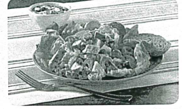
Enjoy the crunchy, juicy goodness of apples and grapes in this Chicken Waldorf Salad, served on mixed greens and topped with low-fat dressing. End your meal with Blueberry-Lime Yogurt.