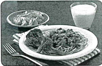
Tomatoes, carrots, celery, and onions are key to this whole-grain Spaghetti and Quick Meat Sauce, paired with broccoli florets. Finish with warm Roasted Pears and Vanilla Cream.

There are so many ways to eat Fruits & Vegetables every day.